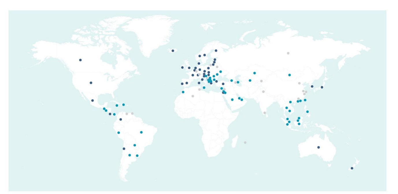
Figure 1. Map of PISA countries and economies

in the sixth assessment (2015) and 79 in the seventh assessment (2018). In 2022, 81 countries and economies participated in PISA.