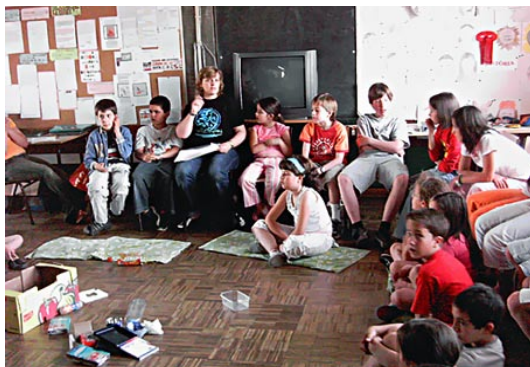
Another way of working inside the nucleus