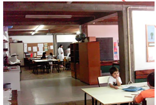
One of the nuclei of the Ponte School which has remained an open space