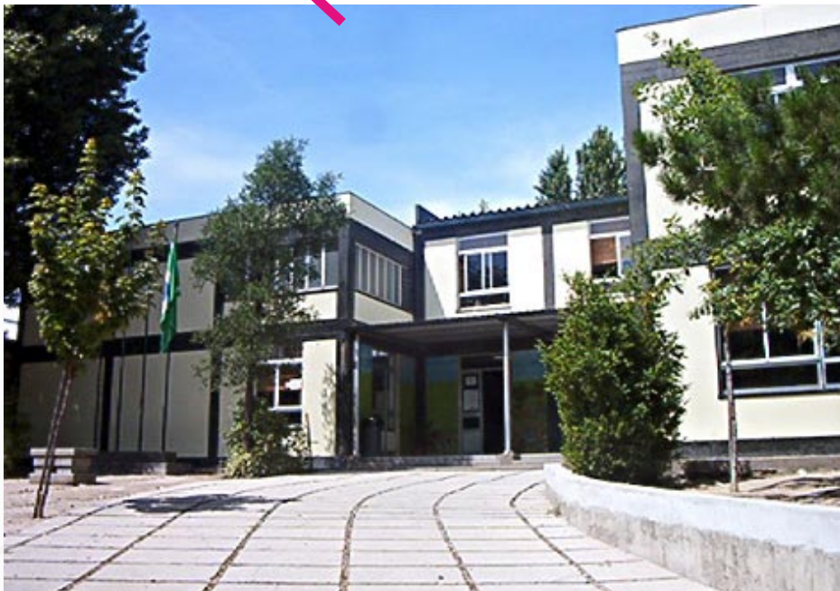
Escola da Ponte

Open plan schools have been largely contested in Portugal; many teachers, administrators and even parents consider this model of schooling inappropriate and therefore a failure. Recently however the Escola da Ponte, one of the open plan schools that has survived, was recognised as one of the country's most innovative educational facilities. Curiously, one of the main reasons for the school's "success", in the opinion of its teaching staff, is precisely the open space design.