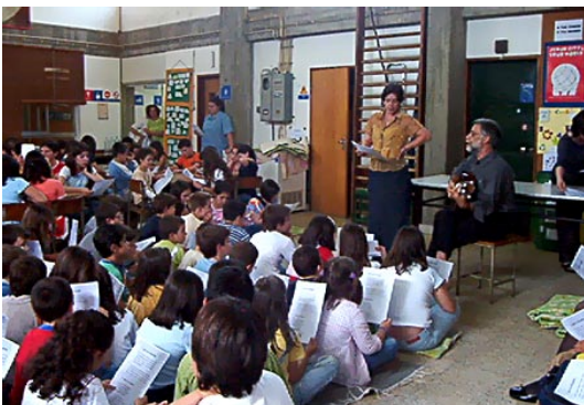
Meeting in the Escola da Ponte 's multifunctional room