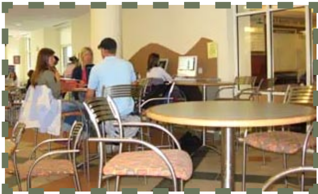
Appalachian State University Cyber café.

Internet cafés create an informal collaborative environment. Cafés often include both a wireless environment for laptops and a few computer workstations configured for guest login. Comfortable and inviting upholstered furniture provides a wonderful opportunity for students to gather informally for discussion and group collaboration. Having the furniture on wheels allows students to move it around into whatever configuration is needed to accommodate their numbers.