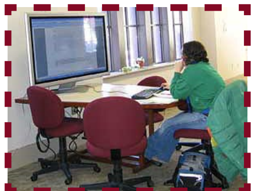
Mount Holyoke College Collaboration area with shared plasma screen.

In addition to enclosed rooms, collaborative learning spaces are found throughout the commons. Using a variety of furniture configurations, spaces have been clearly designed to enable collaborative work. At the minimum, collaboration is encouraged by computer work areas large enough to accommodate two or more users. Connecticut College provides collaborative work areas in booths along the periphery of their café area. Mount Holyoke has collaborative work spaces with large screen monitors in designated areas of their commons. Successful spaces for collaboration also include tables with central electrical wiring for laptop use.