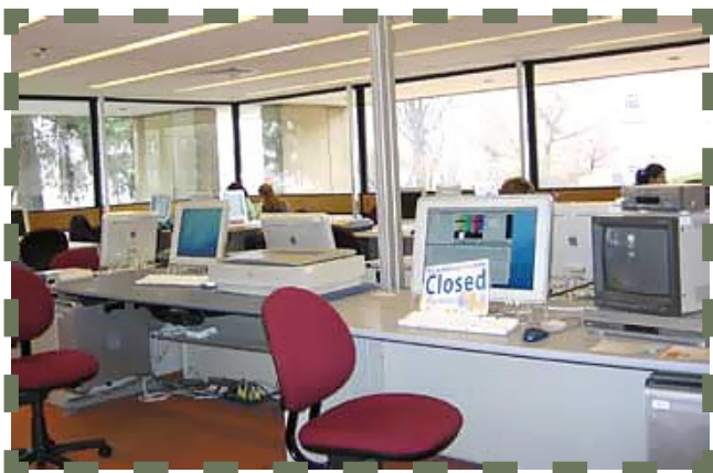
Hamilton College Multimedia presentation centre with high-end Macs, digital editing equipment and scanners.

Presentation support centres. An important feature of the learning commons is an advanced technology facility to support students in developing multimedia projects. Presentation support centres go by many names: multimedia presentation centres, advanced technology labs, digital studios, media authoring labs, technology courtyards, special projects computer labs, etc. These spaces usually propose a mix of high-end PCs and Macintosh computers with full suites of macromedia software and other image and editing software. A good example of a highly equipped technology lab is at Hamilton College. Their multimedia presentation centre supports a variety of high-end multimedia enhanced projects including digital and audio editing, large format printing that can be used to make posters for conference and seminar presentations, and web content development with video, audio and animation.