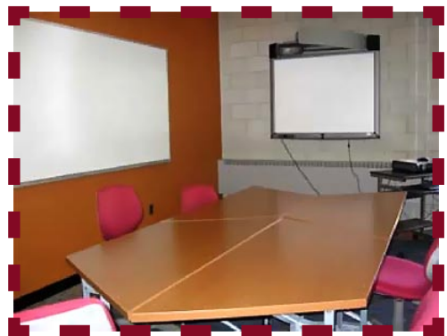
Bridgewater State College Large group study room with movable furniture, whiteboard and projection.

In addition to enclosed rooms, collaborative learning spaces are found throughout the commons. Using a variety of furniture configurations, spaces have been clearly designed to enable collaborative work. At the minimum, collaboration is encouraged by computer work areas large enough to accommodate two or more users. Connecticut College provides collaborative work areas in booths along the periphery of their café area. Mount Holyoke has collaborative work spaces with large screen monitors in designated areas of their commons. Successful spaces for collaboration also include tables with central electrical wiring for laptop use.