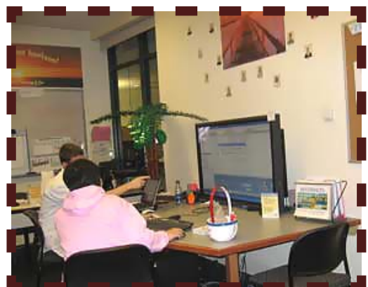
Elon University Student worker helping another student at a shared monitor in the Student Instructional Technology Lab.