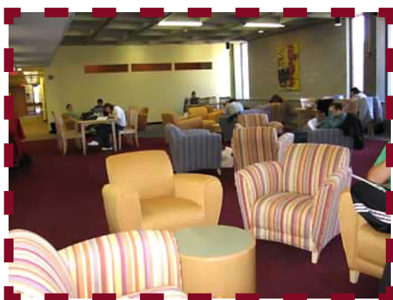
Bridgewater State College Soft seating.

Cafés and lounge areas. Though many may view the availability of food and drink as inconsequential, cafés and comfortable soft seating areas are mainstays of the learning commons model. In encouraging students to spend more time in spaces designed to accommodate the research process from inception to conclusion, we need to give them an opportunity for a quick break and social networking.