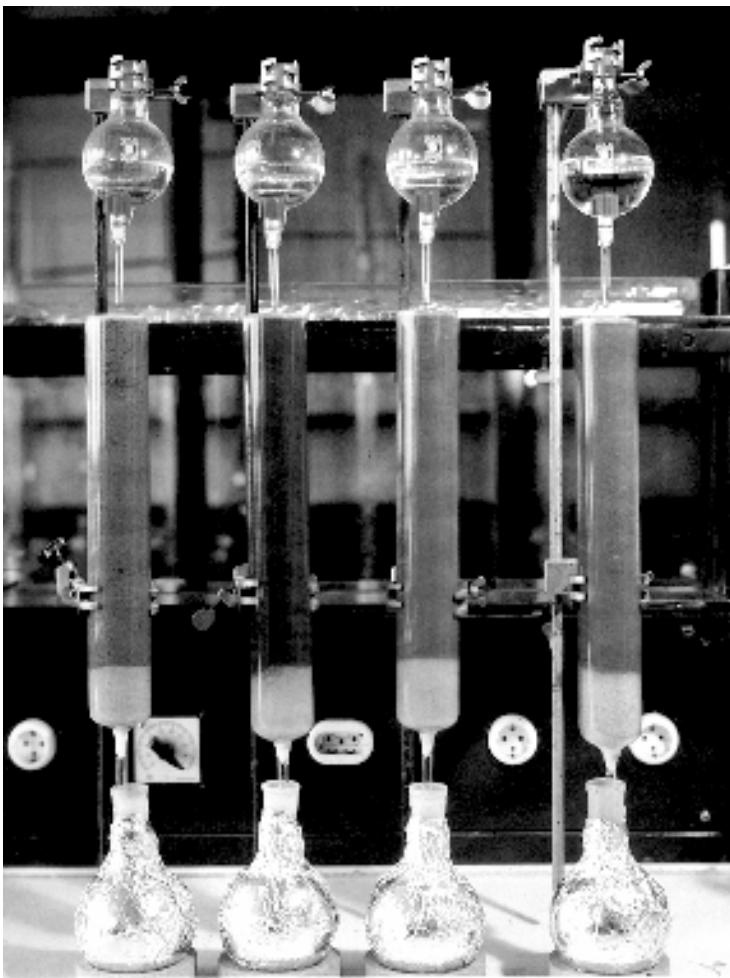
Figure 1: Example of non- sectionable leaching columns made of glass With a length of 35 cm and an inner diameter of 5 cm (1)

← Dropping funnels for application of artificial rain